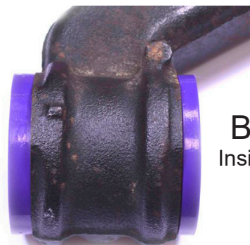
B bush Inside of arm